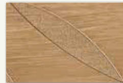
Natural Palm Leaf