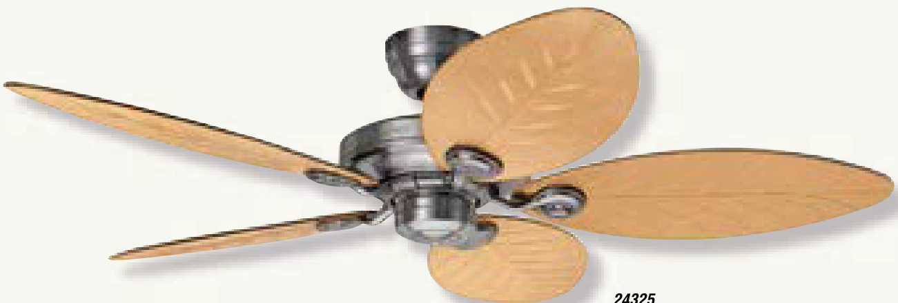
24325 Raw Aluminum finish with 5 plastic Natural Palm Leaf/Natural Wicker reversible blades