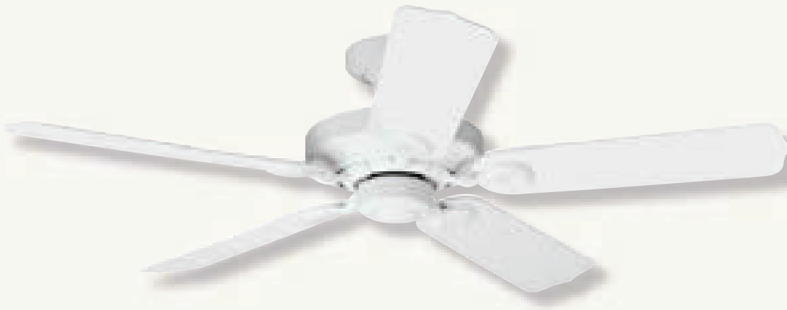
24326 White finish with 5 White (plastic) blades