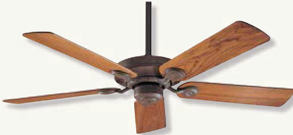
24324 Weathered Brick finish with 5 Solid Teak blades