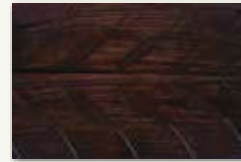
Antique Dark Palm Leaf