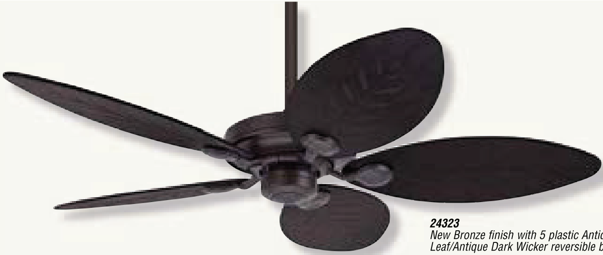
24323 New Bronze finish with 5 plastic Antique Dark Palm Leaf/Antique Dark Wicker reversible blades