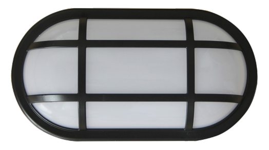
BULK11 & 12