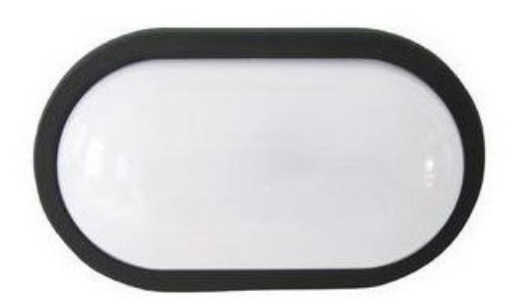
Optional cage/guard removed