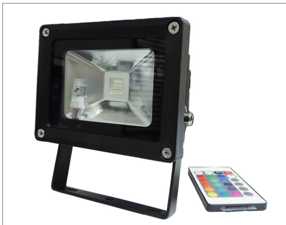
▲ CLA323610RA Memory mode (Will restart on selected colour - except when using fade) Infrared remote range up to 8m