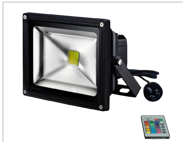
▲ CLA323630R Memory mode (Will restart on selected colour - except when switched off at wall) Infrared remote range up to 4m