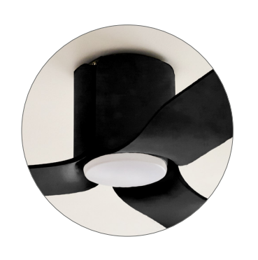
Black CCT LED Light Kit F01501/200A