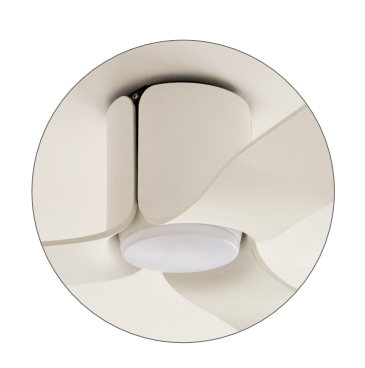
White CCT LED Light Kit F01501/100A