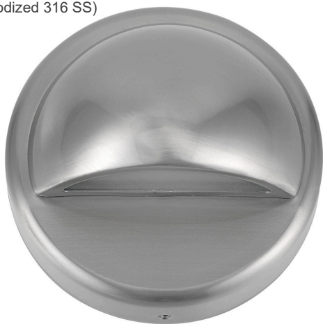
STE13 (Anodized 316 SS)